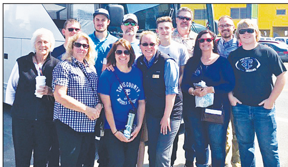
The group from Towns County that traveled to Alaska earlier this month.