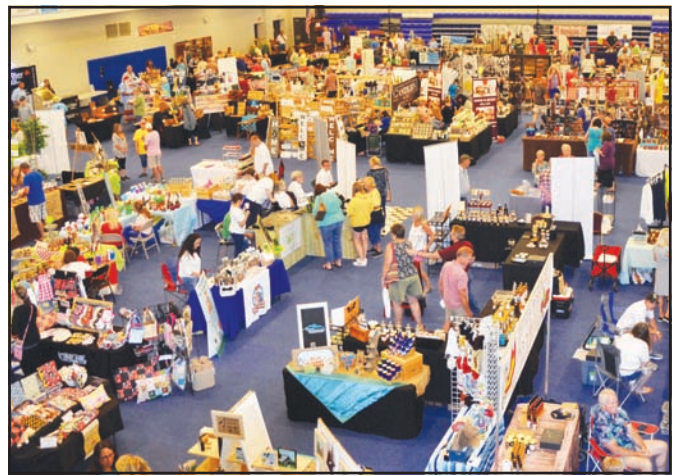
Vendors and patrons flocked to the Made in Georgia Festival over the weekend to celebrate items made right here in the state.