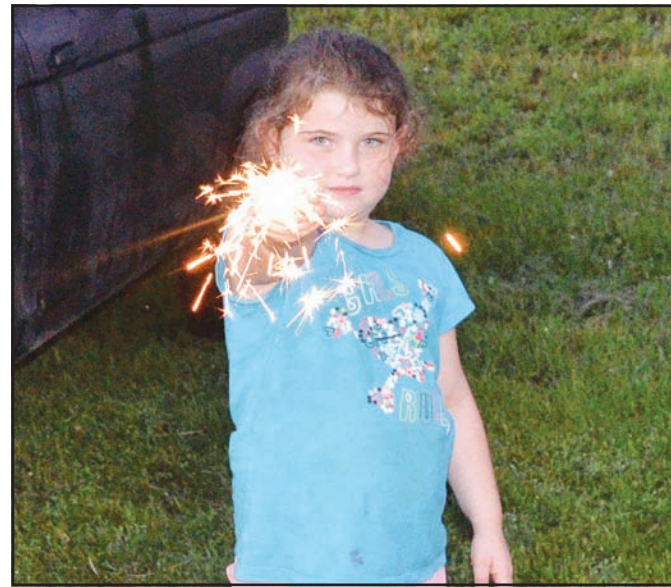
A youngster celebrating Independence Day with a sparkler at the 2018 Georgia Mountain Fairgrounds Fireworks Show.